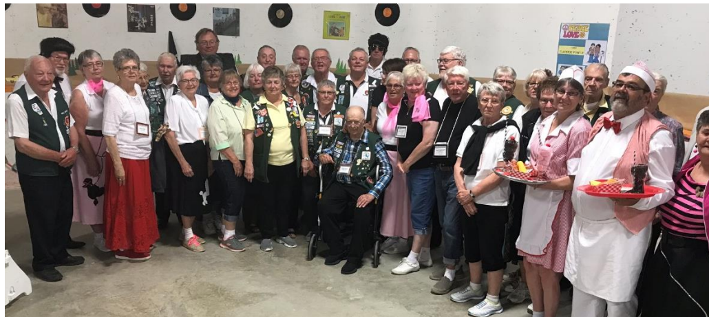
...This group picture taken at the Rich Valley Rally, June 2019